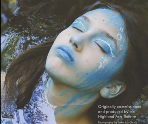
Originally commissioned and produced by the Highland Arts Theatre